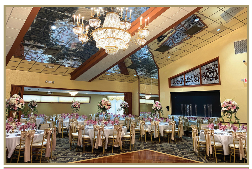
Mirrored Ceiling Featuring Italian Crystal Chandeliers Reflecting Upwards