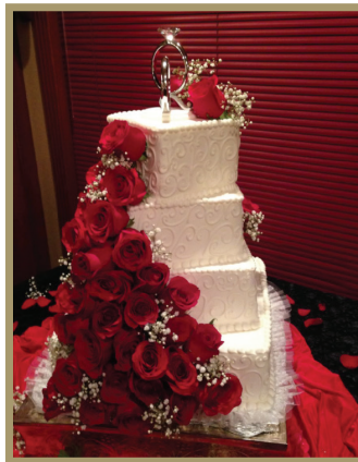
3 Tier Designer Cake Included on Parties of 175 Guests or More

Beer: Miller Genuine & Miller Lite Draught Champagne Toast for Bridal Party and Guests