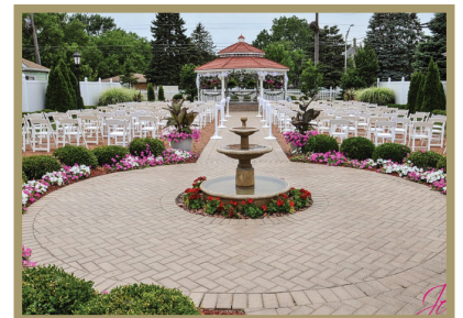
Private Wedding Gazebo