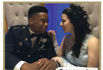
Royalty Throne Chairs Available for Add On