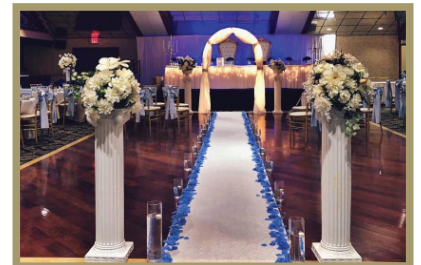
Ceremony in Room