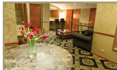
Newly Remodeled Boda Suites