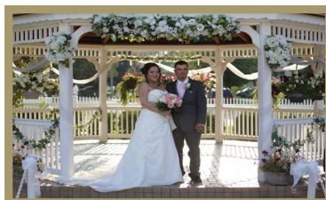
Outdoor Wedding Gazebo for Photography Included

Private Bridal Suite Martinique Banquet Linen and Bows Three Tower Candlelight Centerpieces Your Names & Pictures on the Martinique Marquee Use of Martinique Wooden Wishing Well Wedding Garden for Photography