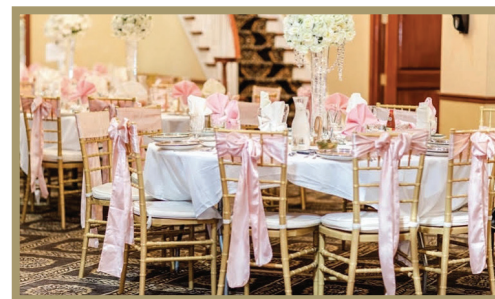
Gold Chiavari Chairs