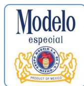
Modelo Especial Beer