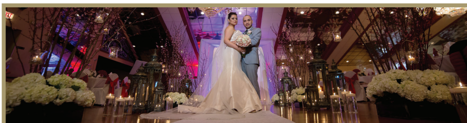
Mirrored Ceiling Featuring Italian Crystal Chandeliers Reflecting Upwards