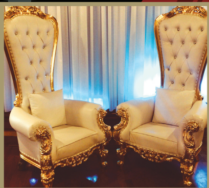
Royalty Throne Chairs Available in Silver & Gold

Afternoons 11:30-3:30PM or 12:00-4:00PM 4 Hour Package & 3 Hour Open Bar Saturday - Sunday Evenings 6:30-11:30PM 5 Hour Package & 4 Hour Open Bar Friday - Sunday Plus Gratuity & Sales Tax. Prices and Packages Subject to Change without Notice. This Pricing is for Parties of 175 guests or more. This menu has been discounted for selective dates.