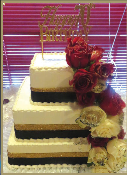
3 Tier Designer Cake Included on Parties of 175 guest or more