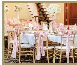
Gold Chiavari Chairs