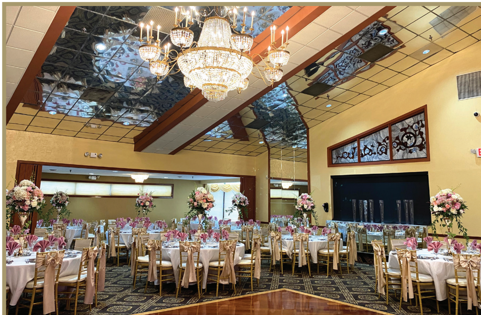
Mirrored Ceiling Featuring Italian Crystal Chandeliers Reflecting Upwards

Choice of Cake & Ice cream or Parfait (Strawberry or Chocolate) (available)