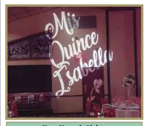
Your Name in Lights