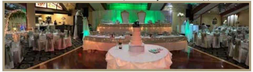
Gold Chiavari Chairs with Ivory Chair Padding, Martinique Designer Bows, and Napkins

Choice of Cake & Ice cream or Parfait (Strawberry or Chocolate) (available)