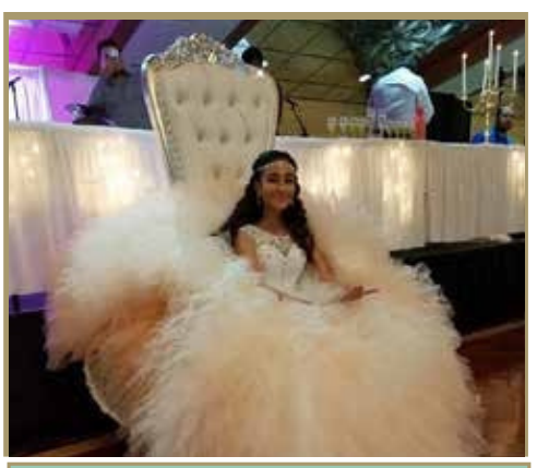
Throne Chairs Available for Add On in Silver & Gold